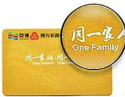
Hot Laser Silver