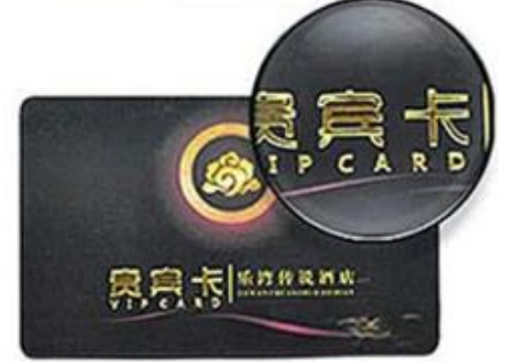
Hot Gold Lettering

We are Producing different RFID Smart Card with different code number