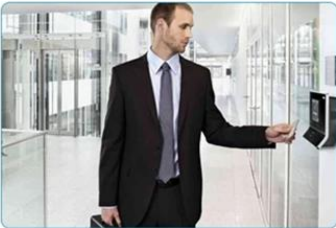
Access Control System