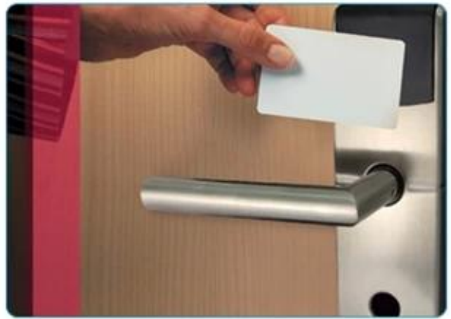
Hotel Card Application