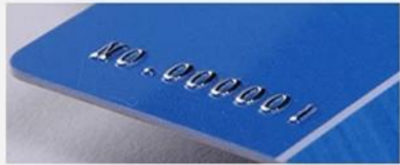
Embossed numbering (Silver)