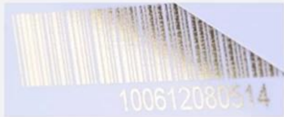
Flat numbering (golden)