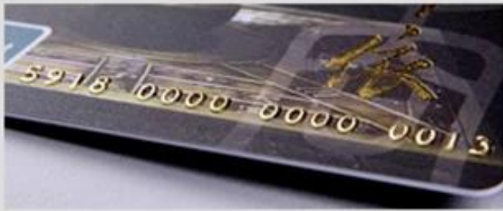
Embossed numbering (Golden)