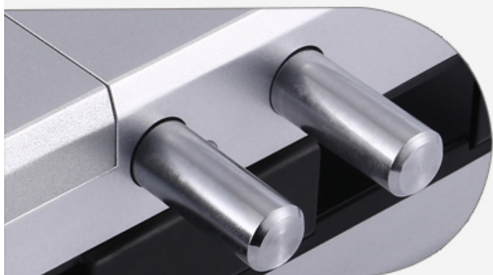
Cast steel double lock bolt