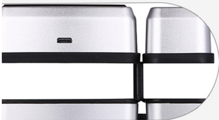
Emergency charging port