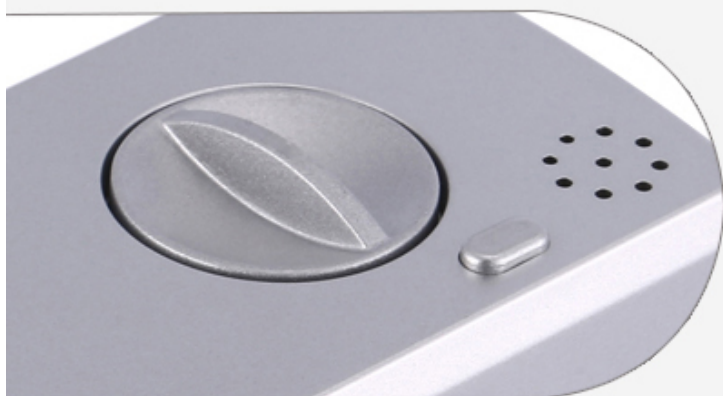
Rotate button one button unlock