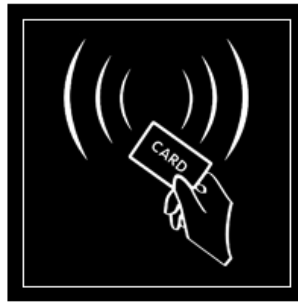
ID EM Cards

Support external emergency battery input