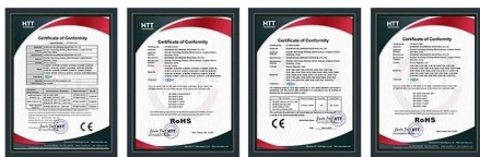
Access Control CE Access Control RoHS EM Lock EMC Certificate EM Lock RoHS Certificate