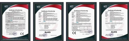
Access Control CE Access Control RoHS EM Lock EMC Certificate EM Lock RoHS Certificate