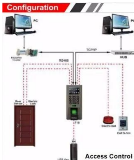
Access Control System Application Diagram

RFID Waterproof Metal access control Application