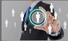
1000 users (990 Normal users + 10 Visitor users)