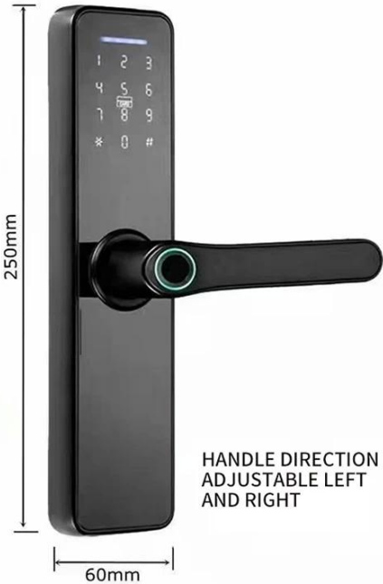
HANDLE DIRECTION ADJUSTABLE LEFT AND RIGHT