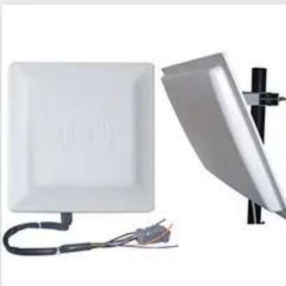
Long Distance UHF Reader