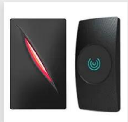
Access Control Reader