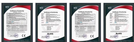
RFID Card Reader CE RFID Card Reader RoHS UHF Reader CE Certificate UHF Reader RoHS