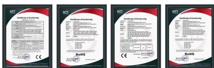
Access Control CE Access Control RoHS EM Lock EMC Certificate EM Lock RoHS Certificate