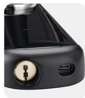
Mechanical Key Unlock Micro USB Port Power Supply