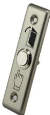
Silver Push Button Switch