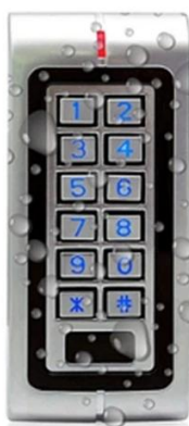
Waterproof RFID Reader Door Access Control