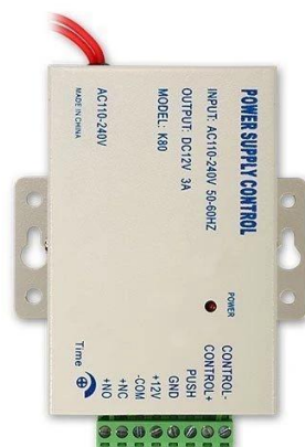
Access Power Supply