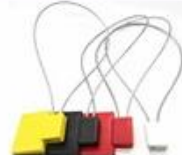
UHF Seal Rfid Tag