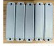
Anti-metal tag 85*20mm