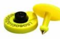
Cattle Animal Ear Tag