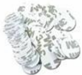
Coin Tag ID/IC 20mm