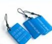
T5577 Tag 50*30MM