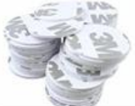
ID/IC Dia 25mm