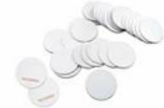
NFC Tag NTG215 25MM