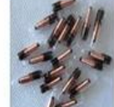
Animal Capsule Glass Tag