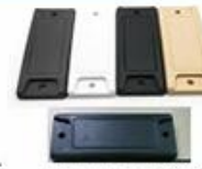
Anti-metal tag 79*30mm