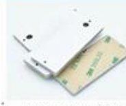
Anti-metal tag 95*25mm