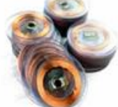
ID/IC Tag Dia25mm