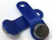
RW 1990A Tag