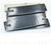
PCB Metal tag 50*10mm