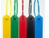
RFID Cable Tie Tag