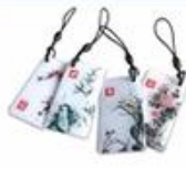
ID/IC Epoxy Tag