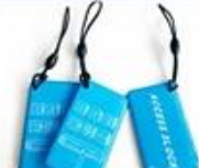
UID Tag 50*30MM