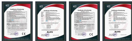
RFID Card Reader CE RFID Card Reader RoHS UHF Reader CE Certificate UHF Reader RoHS