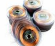
ID/IC Tag Dia25mm