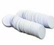
ID/IC Coin Tag Dia 30mm