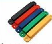
Anti-metal tag 135*21mm