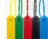
RFID Cable Tie Tag