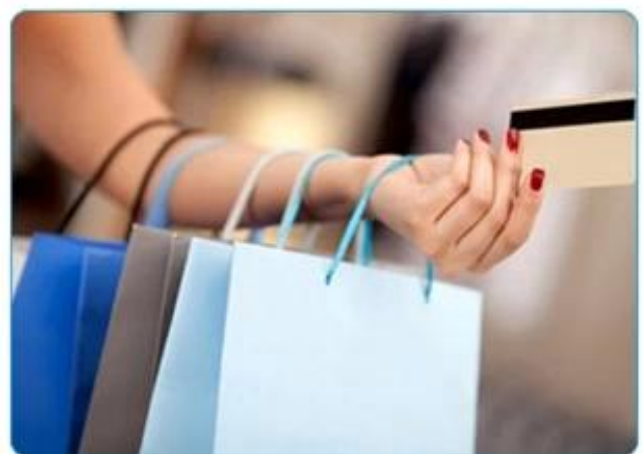
Magnetic Stripe Card