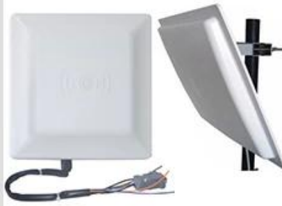
Long Distance UHF Reader