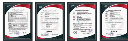
Access Control CE Access Control RoHS EM Lock EMC Certificate EM Lock ROHS Certificate