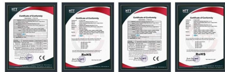
RFID Card Reader CE RFID Card Reader RoHS UHF Reader CE Certificate UHF Reader ROHS