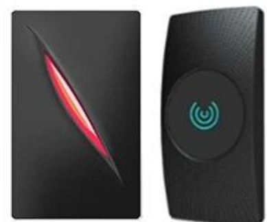
Access Control Reader