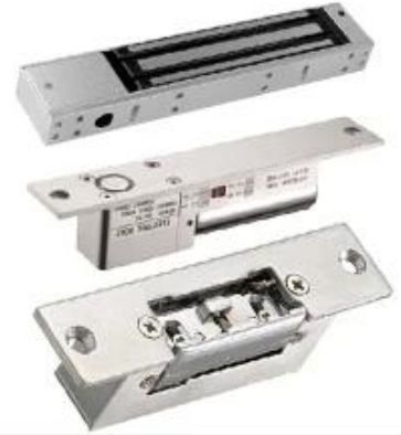
Door EM Lock