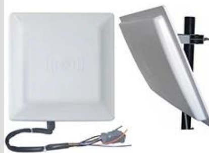
Long Distance UHF Reader