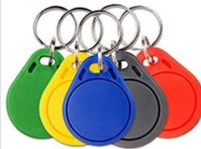
RFID Key fob