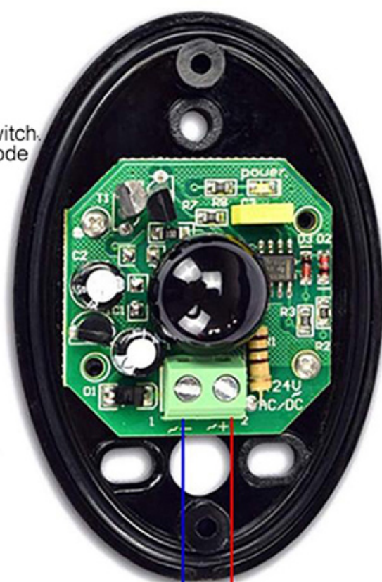
Infrared light projector