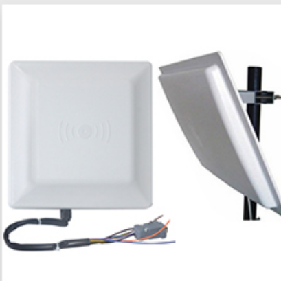
Long Distance UHF Reader