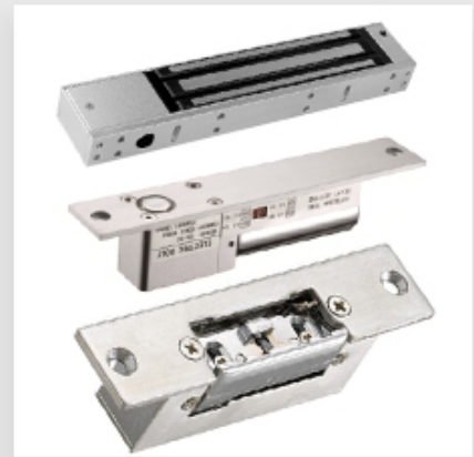
Door EM Lock