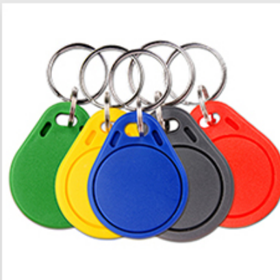
RFID Key fob