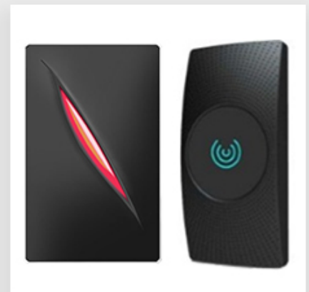
Access Control Reader