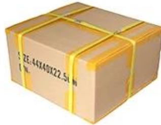
2. Ibutton Card: 100pcs/box 5000pcs/carton