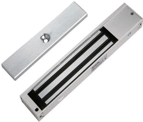
電磁ロック 350 mm電圧選択可能 12v 24v 電線付 電線長約800 mm 350 mm