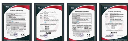
RFID Card Reader CE RFID Card Reader RoHS UHF Reader CE Certificate UHF Reader RoHS