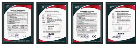
RFID Card Reader CE RFID Card Reader RoHS UHF Reader CE Certificate UHF Reader RoHS