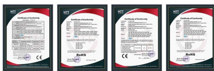
Access Control CE Access Control RoHS EM Lock EMC Certificate EM Lock RoHS Certificate