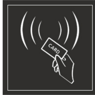
ID EM Cards