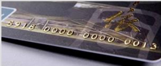
Embossed numbering (Golden)