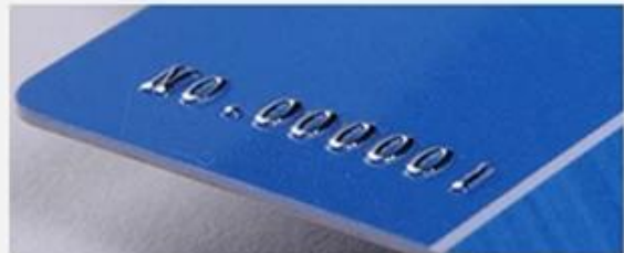
Embossed numbering (Silver)