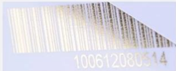
Flat numbering (golden)