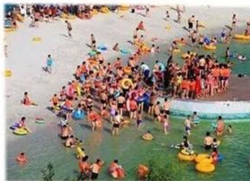
Hot Spring Hotel/Spa