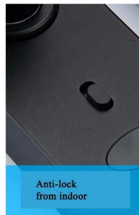
Anti-lock from indoor