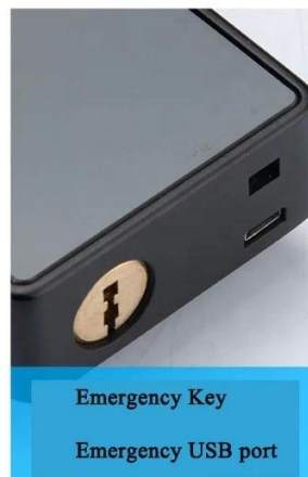
Emergency Key Emergency USB port