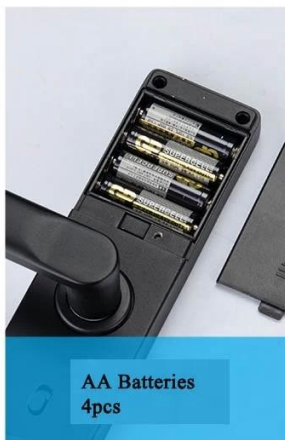
AA Batteries 4pcs

Excellent quality more attention to details