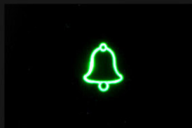
Backlit doorbell button