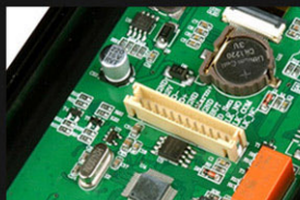
Import ARM32-bit CPU system