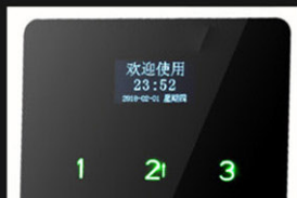
OLED LCD screen