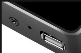
U disk transfer information