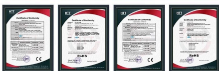
RFID Card Reader CE RFID Card Reader RoHS UHF Reader CE Certificate UHF Reader ROHS