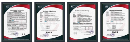
Access Control CE Access Control RoHS EM Lock EMC Certificate EM Lock ROHS Certificate