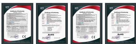
RFID Card Reader CE RFID Card Reader RoHS UHF Reader CE Certificate UHF Reader RoHS