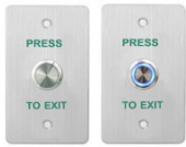
K14F K14FL 115x70mm