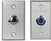
K4A K4AL 86x50x33mm