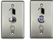
K6D K6DL 115x70x25mm