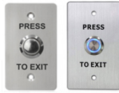
K14 K14DL 115x70mm