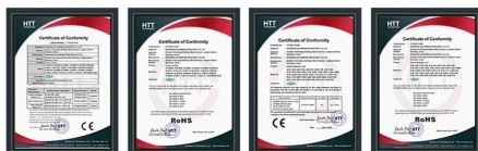
Access Control CE Access Control RoHS EM Lock EMC Certificate EM Lock RoHS Certificate