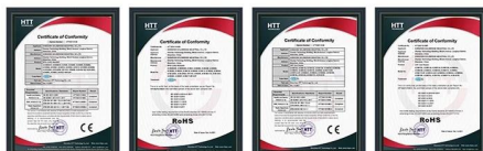
RFID Card Reader CE RFID Card Reader RoHS UHF Reader CE Certificate UHF Reader RoHS