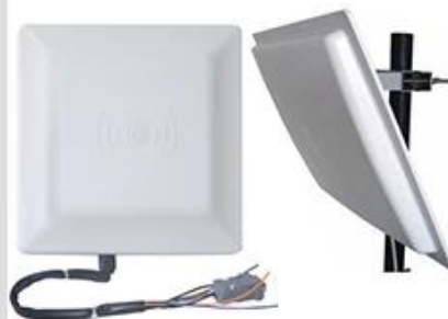
Long Distance UHF Reader