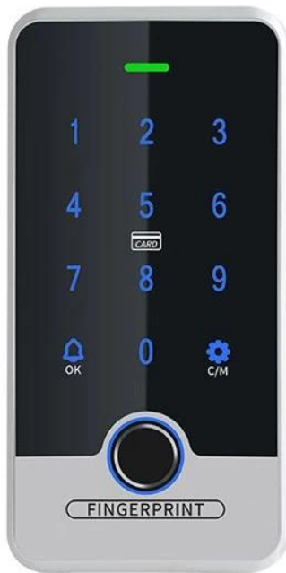
Light on state