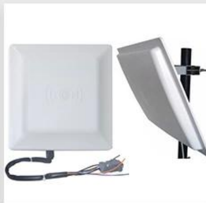
Long Distance UHF Reader