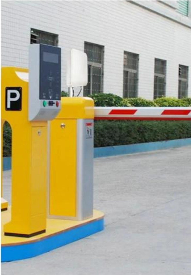
Vehicle Access Control