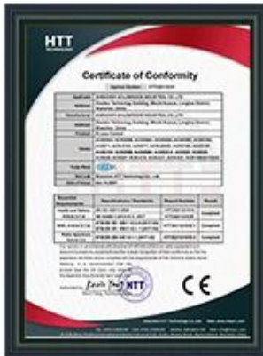
Access Control CE