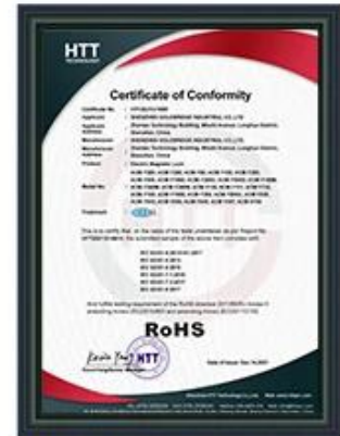
EM Lock RoHS Certificate