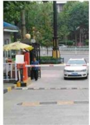
Automatic Charging Without Parking