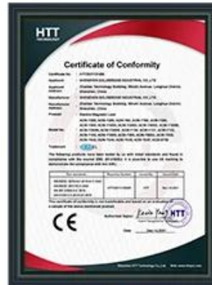
EM Lock EMC Certificate