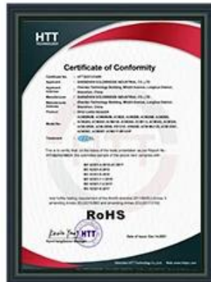
RFID Card Reader RoHS