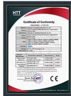
UHF Reader CE Certificate