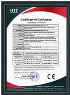
RFID Card Reader CE