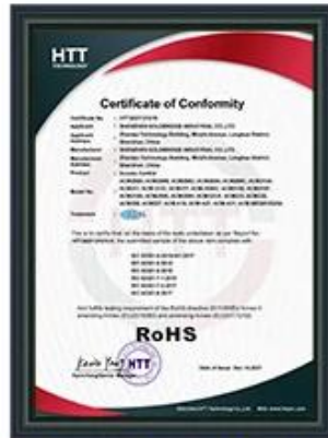
Access Control RoHS