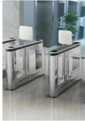
Personnel Access Control