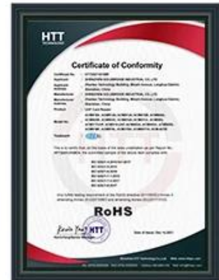
UHF Reader RoHS