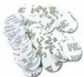
Coin Tag ID/IC 20mm