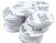
ID/IC Dia 25mm