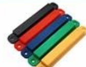
Anti-metal tag 135*21mm