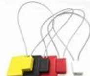
UHF Seal Rfid Tag