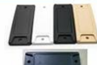
Anti-metal tag 79*30mm