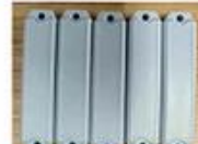
Anti-metal tag 85*20mm