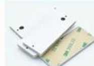
Anti-metal tag 95*25mm