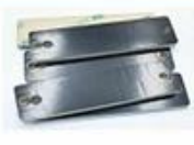
PCB Metal tag 50*10mm