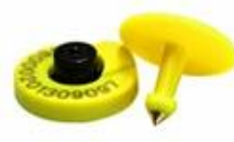
Cattle Animal Ear Tag