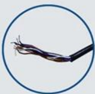
50cm cable (Standard)