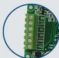
Terminal Blocks (Optional)