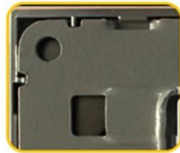
Sturdy steel frame