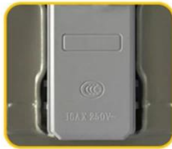
backside with PC material