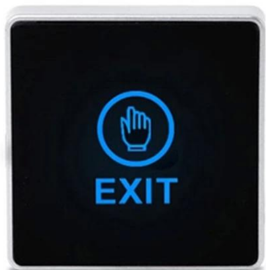
Power on status