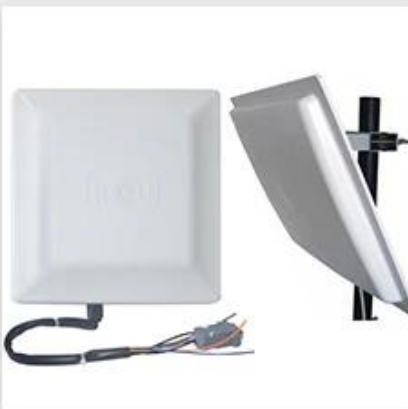
Long Distance UHF Reader