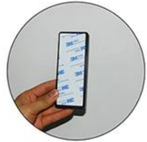
Stick it on the back of the keypad