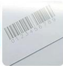
Laser Barcode & QR Code