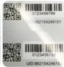
DOD Barcode & QR Code