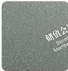
Matt surface (Rough Matt)