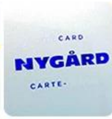
Silk Screen Printing