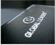
Sliver Hot Stamping