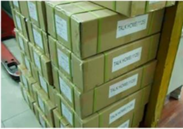
Outside Carton Package