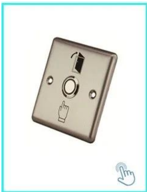
Exit button on the Real Touch port K2B: 86 * 86mm