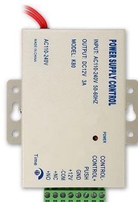
Access Power Supply