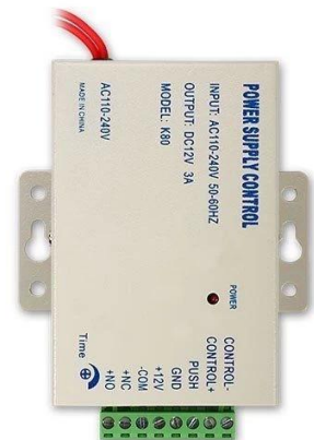
Access Power Supply