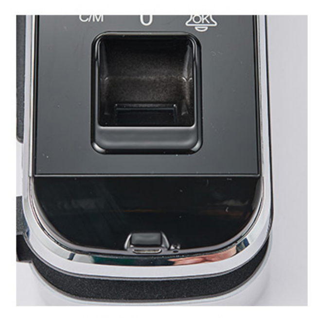
USB emergency door opening