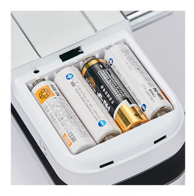
Low battery alarm